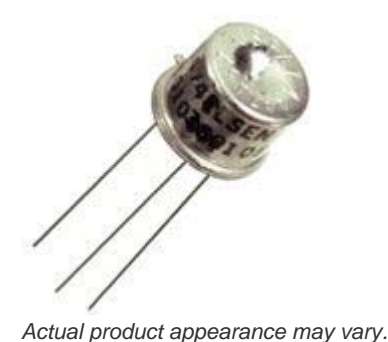
3601 Series TO-5 Thermal Switches