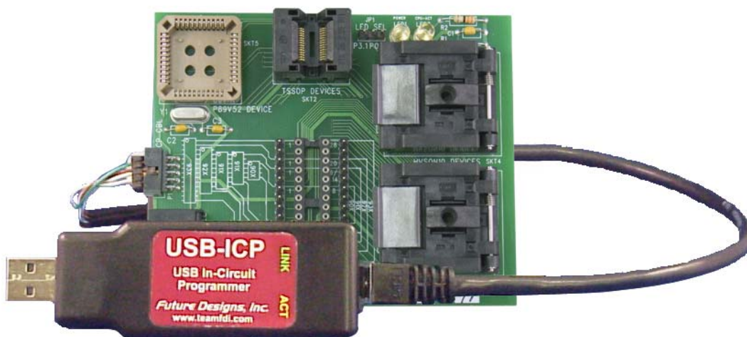
USB-ICP-SAB9 shown with USB-ICP-LPC9xx (USB-ICP-LPC9xx Sold Separately)