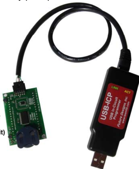
Example User Target Board (Not Part of Kit)

The ISP function uses only six pins: VCC, GND, RXD, TXD, PSEN- and RESET. The simple circuit above is all that must be added to the user’s application to use ISP with USB-ICP.