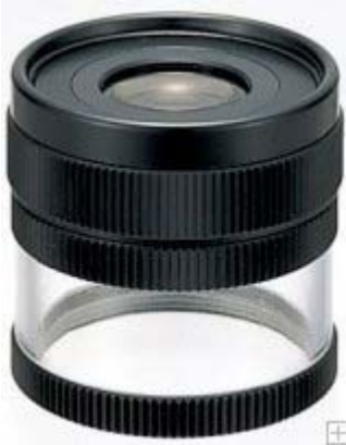
10x Scale Loupe Model M1210