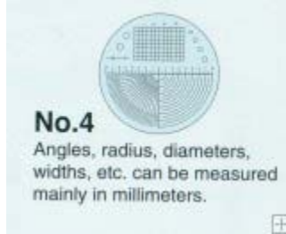
No.4 Reticle Scale (for use with M1207 & M1210 Loupes)