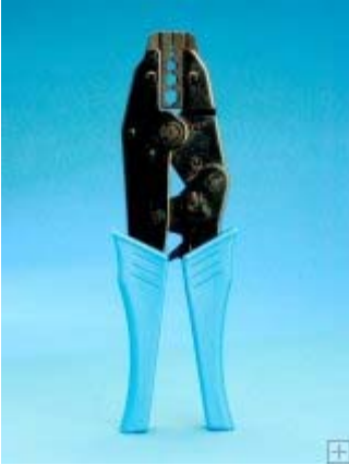
Crimping Tool Frame Only