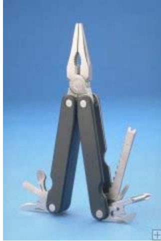
Aven Multimax Pocket Pro