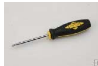
Tamper-proof Torx Screwdriver, T15 x 80mm