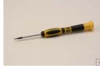
Star / Temper-proof Screwdriver, T10 x 50mm