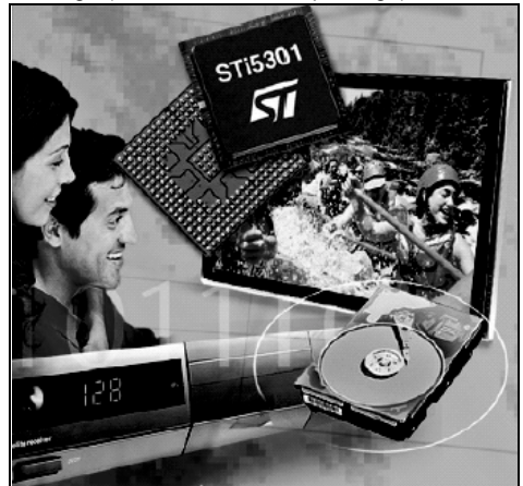
Figure 1. STi5301 low-cost interactive set-top box