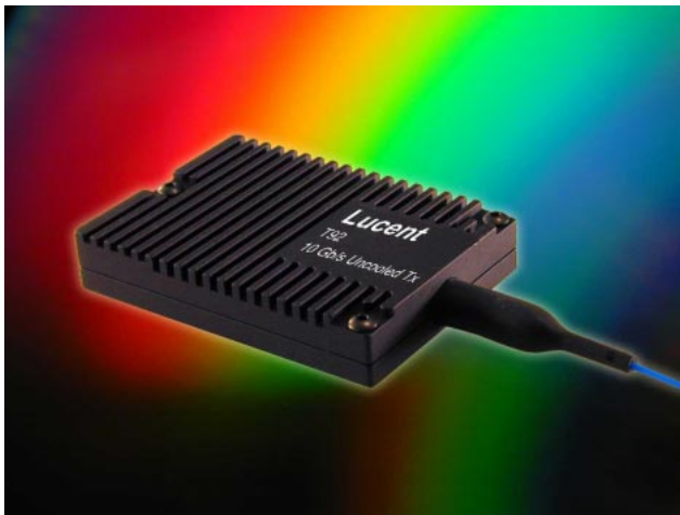
Offering SONET/SDH compatibility, the T92-Type Uncooled Laser Transmitter is manufactured in a 24-pin DIP assembly with a single-mode fiber pigtail.